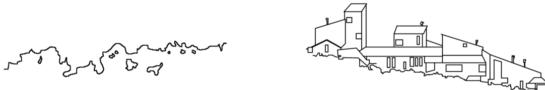
Figures 8 and 9. Reproduction of Bovill's images of the coastline D=1.3215 and Condominium One D=1.426 of Sea Ranch.

Despite such clear conceptual links between the visual and formal qualities of Condominium One and the landscape of Sea Ranch, the only data provided by Bovill to support his argument are calculations of the fractal dimension of the coastline at Sea Ranch. In order to investigate any connection between the visual complexity of the landscape and of the building, new data has to be produced. For the present paper, the computational fractal analysis method has been used to recalculate the D of the coastline image provided by Bovill (Figure 8). Then, for comparative purposes, the D of the single image Bovill provides of Condominium One is also produced (figure 9).