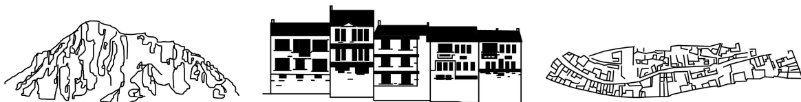
Figures 5-7: Reproduction of Bovill's images for fractal analysis of Amasya - the hill, the elevation of the row of houses and the urban plan

The city of Amasya, Turkey, has been settled for over 2000 years. Members of the ruling royal family and important leaders were based there during the Ottoman period, when the city became established as a significant centre for creativity and the base for "many important court architects, artists, artisans and poets" (Bechhoefer 1998:25). The area of Amasya analysed by Bechhoefer and Bovill is Hatuniye Mahallesi which is "the historic neighbourhood on the north bank of the Yesilirmak River [and] is the clearest embodiment of Amasya's history. [...] The riverfront houses are among the most important assemblages of traditional residential construction in Anatolia" (Bechhoefer 1998: 28). These buildings maintain much of their history and are set in a significant geographical location. Looming above the strip of old houses of Hatuniye Mahallesi is a large craggy hill, appearing as one massive peak. To compare the fractal dimensions of the architecture and the local landscape, Bechhoefer and Bovill undertook a box-counting analysis calculation on three images; a line drawing of the dominant hill (figure 5), the elevation of five connected historical houses along the river front (figure 6), and the urban layout plan of Hatuniye Mahallesi (figure 7).